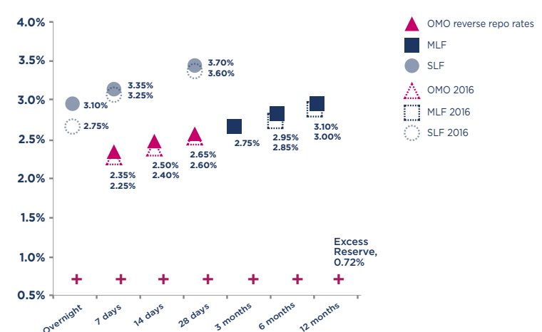
PBoC's widely expected short-term interest rate corridor

Source: PBoC, Coface (Last update: Feb 5, 2017)